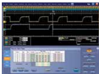
Advanced search function within long waveform records