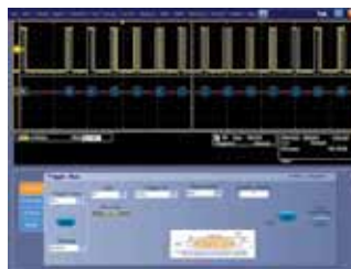
Capture triggering on specific transmit data

What's included: One passive voltage probe per analog channel (TPP0500 for 500 MHz and 350 MHz models; TPP1000 for 2 GHz and 1 GHz models), one P6616 (16-channel logic) probe (MSO models only), user manual, front cover, OpenChoice Desktop and NI LabVIEW SignalExpress™ TE (LE version) software, power cord, and calibration document supplied by the manufacturer.